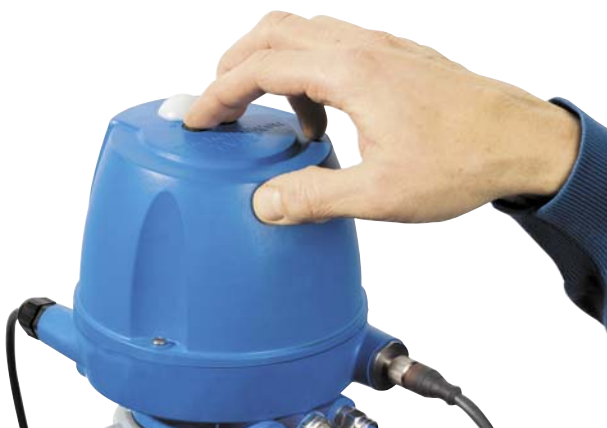
Simple valve setting at the push of a button

inadvertent actions are still prevented since operation requires a combination of de-energizing and a defined time window. For maintenance purposes, the solenoid valve for the main stroke of T.VIS® A-8 is also activated manually via buttons, while the process valve is very quickly returned to the safe operating status.