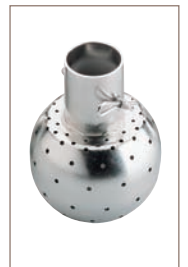
LKRK Static Spray Ball