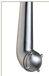
Toftejorg Rotary Jet Head SaniJet 20

The complete coverage, rotary action and impact afforded by rotary jet heads makes them particularly effective in cleaning viscous, foaming or thixotropic products of the type commonly produced in the personal care industry. The efficient removal of such residue also grants significant savings in terms of time and water consumption.