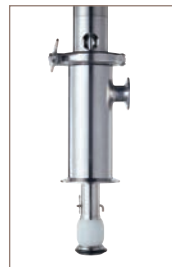
Toftejorg Retractable Rotary Spray Head SaniMidget Retractor