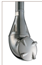
Toftejorg Rotary Jet Head TJ 20G