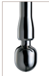
Toftejorg Rotary Spray Head SaniMidget