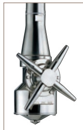
Toftejorg Rotary Jet Head TZ-74