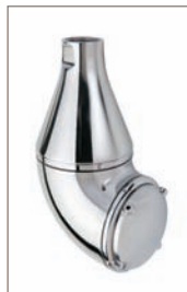
Toftejorg Rotary Jet Head SaniJet 25